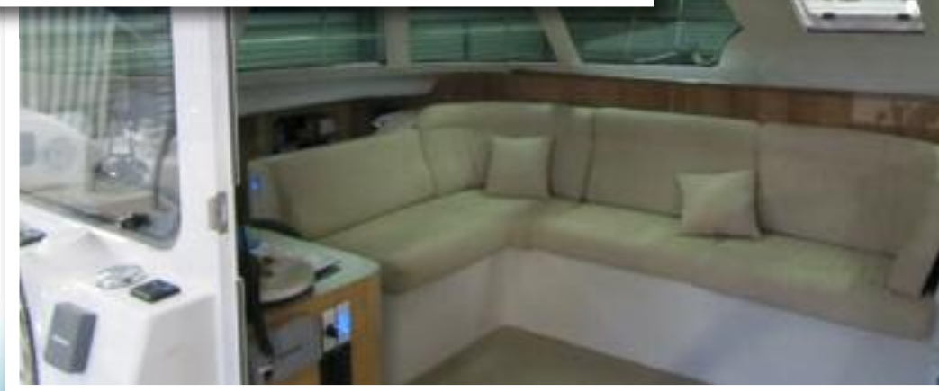
Right: Saloon Setee